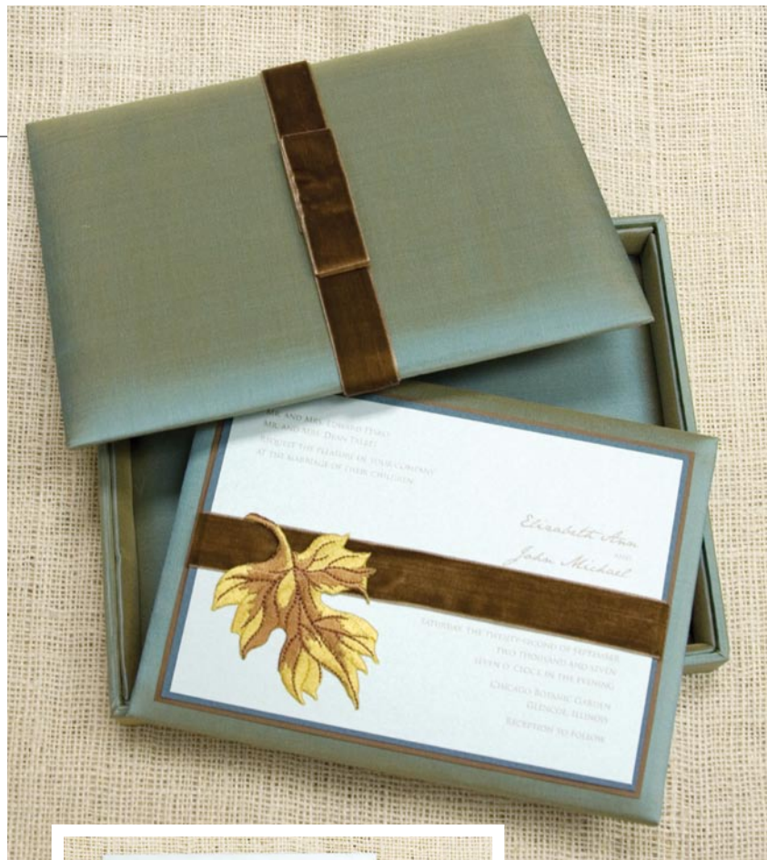
4 ALIA DESIGNS, aliadesigns.com

Maybe a bride simply chose a difficult color palette. What if she is having a fall wedding, but wants to veer away from the traditionally darker, bold fall colors? A light, dusty fall color scheme may require custom invitations.