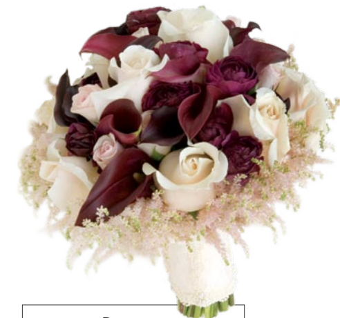
Bouquet GREEN LEAF DESIGNS greenleafdesigns.com