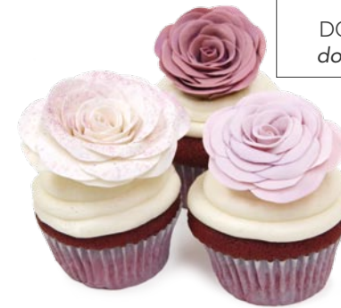
Favor DOTS CUPCAKES dotscupcakes.com