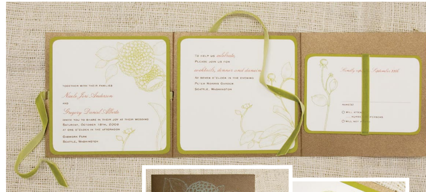
6 ILEE CUSTOM INVITATIONS, ilee.net