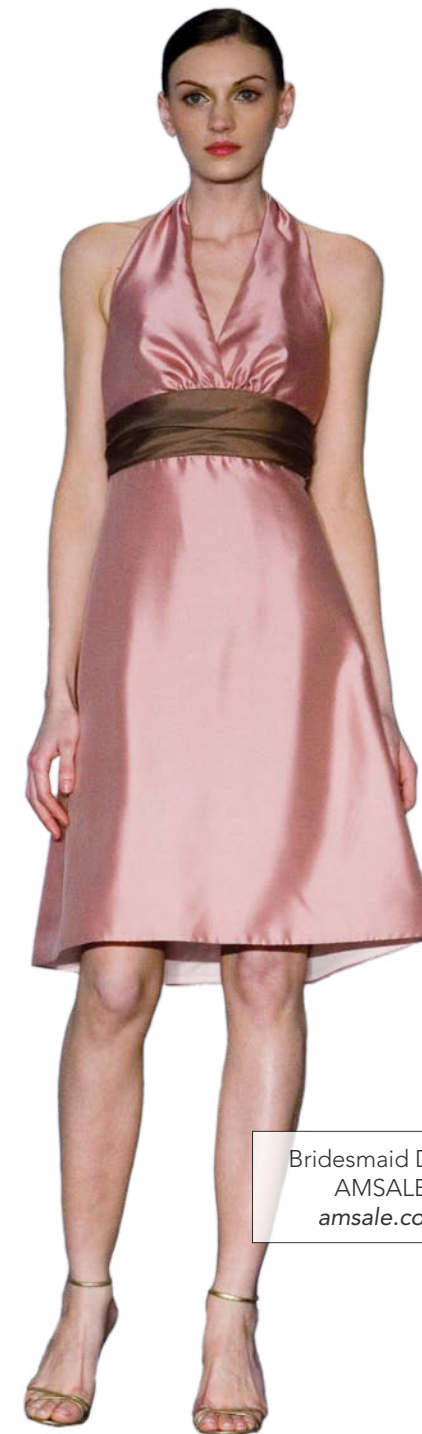
Bridesmaid Dress AMSALE amsale.com