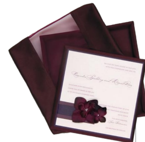
Invitation ALIA DESIGNS aliadesigns.com