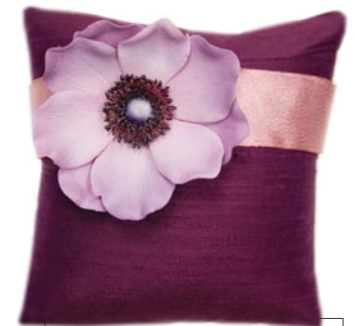
Ring Bearer Pillow HEART PAPER SOUL heartpapersoul.com