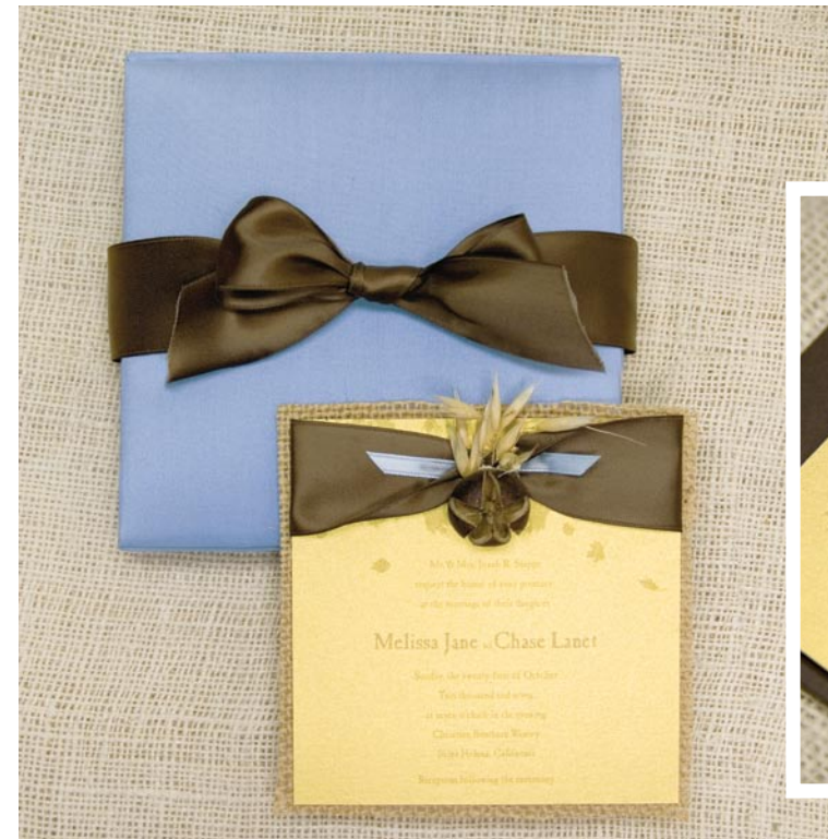
5 ROCK PAPER SCISSORS DESIGN, rockpaperscissorsdesign.com