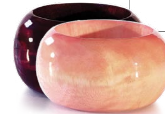
Bridesmaid Gift DIOSCURI dioscURI.us